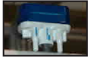
No CR needed on older coils - Install CR 120 on new high flow coils