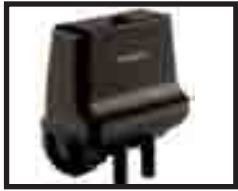
Install CR 160 - Setting #2