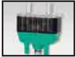
No CR needed majority of time

Note: if pulsators (any style) are in a subway or basement, then order and install CR 120s Item #10505